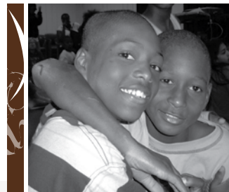
The Teen Club program equips teens to become responsible leaders of the youth who look up to them.