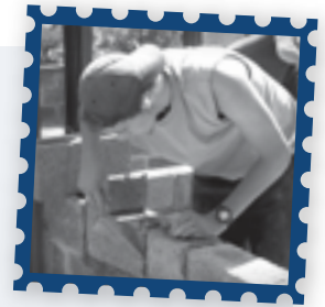
African Quest is a great first step toward responding to God's call to serve in Africa