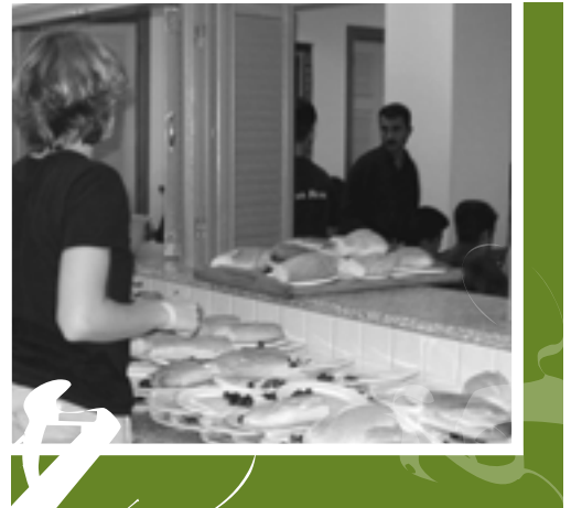
Photo: A worker (left) at the ITeams Athens Refugee Center (ARC) prepares meals for refugees (right). The ARC ministers to displaced individuals and families coming from all over the world.