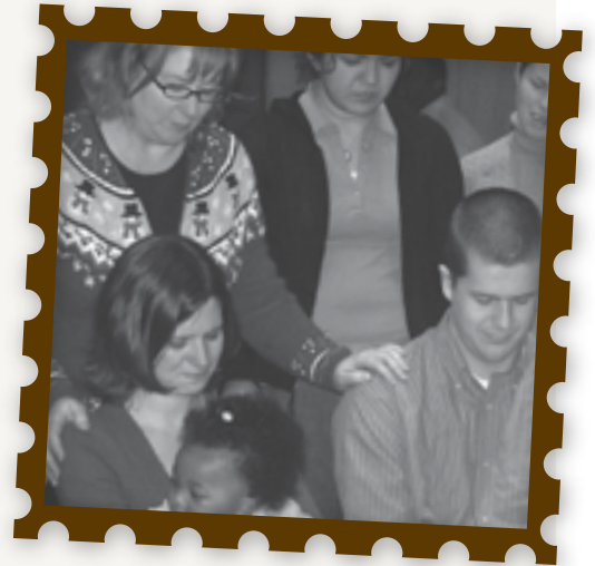
ITeams-USA staff prays for new missionaries during a celebratory gathering marking the completion of their training experience at the Elgin Ministry Center.

To find out more about ITeams' Missionary Training and Life-Long Learning Program visit www.iteams.org/go/preparation .