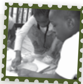
Children create a clay sculpture while participating in the art program in North Lawndale