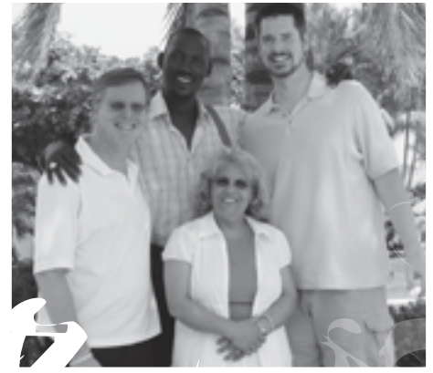
Among other workers from around the world, the ILF brought together ITeams leaders who serve refugees in Africa, Europe, and the U.S.

I have much to learn from my brothers and sisters and have been so blessed by their example .