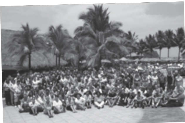
ITeams ministry leaders - ILF 2007